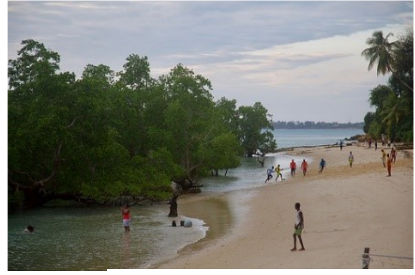
Recreation in coastal mangrove in Tanzania; Photo: Rob Barnes, 2016, www.grida.no/resources/8720

It is found that the empowerment approach for analyzing a situation, and for monitoring progress, is not difficult to use for technical professionals. The four elements are interrelated, which means that just one element is not really empowerment.