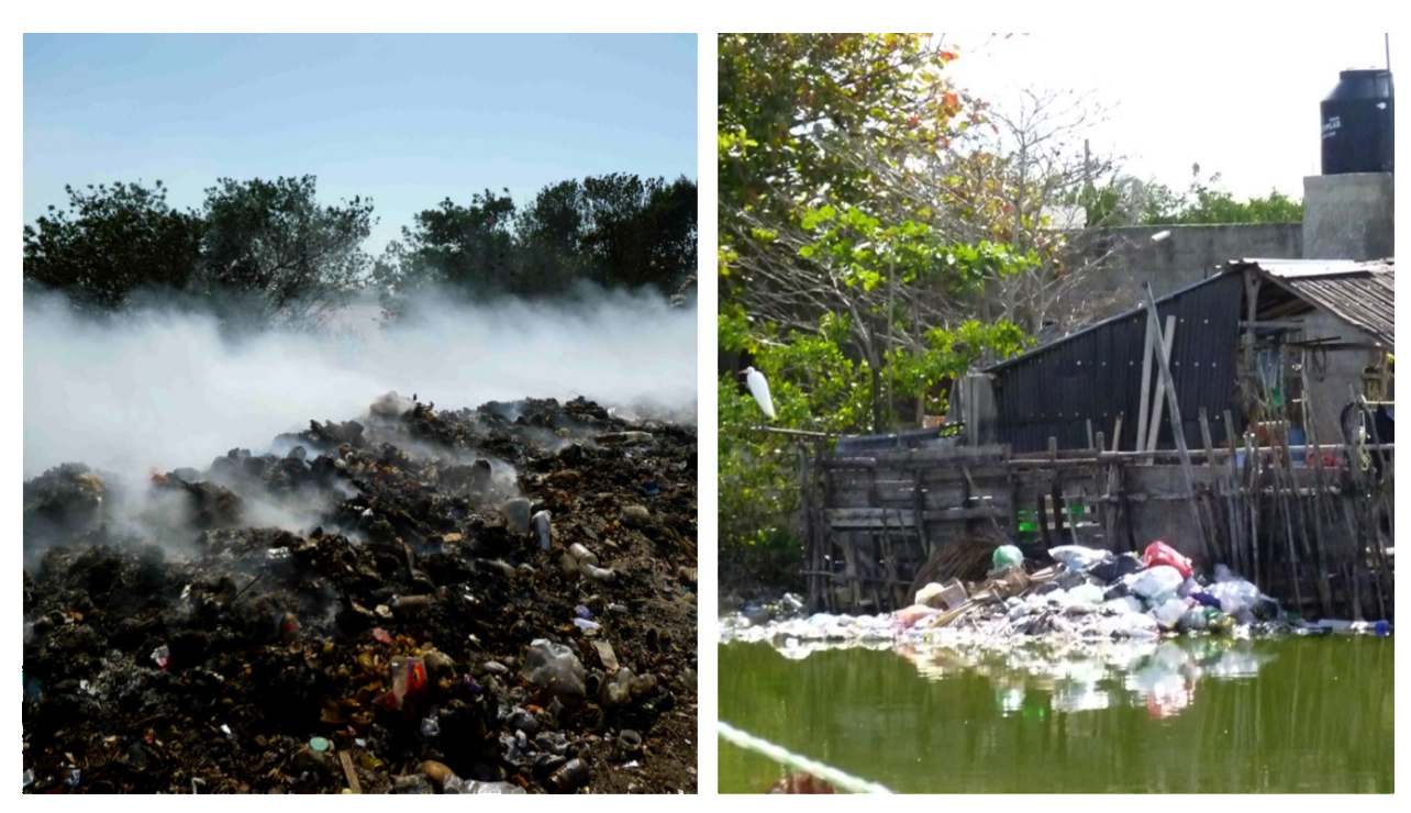
Crisis in plastic waste management in Celestún, in Yucatán province of Mexico; Photo: Anne-Marie Hanson

Celestún is a town located on the northwest coast of the Yucatán Peninsula, within the boundaries of a federally protected conservation area, the Ría Celestún Biosphere Reserve. The area around the reserve forms part of a larger protected corridor of wetlands that is recognized as an international priority site for biodiversity conservation. Despite its location within a conservation area, Celestún shares the same characteristics as many other coastal cities worldwide - increasing in-migration from inland areas and unplanned urbanization, high levels of consumption of disposable products, and an influx of temporary residents during fishing and tourist seasons, all of which lead to the gradual erosion of the coastal landscape and threaten its biodiversity.