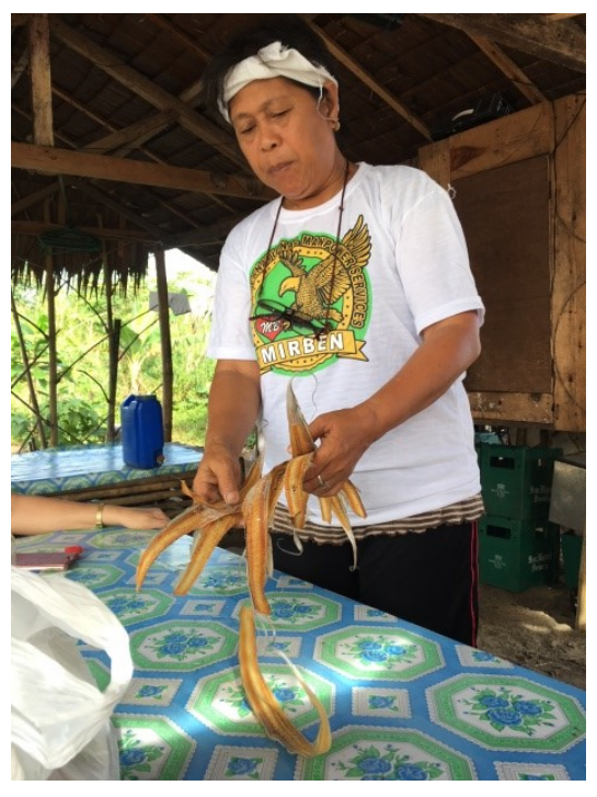
Fisherwomen in Philippines dry fish for selling locally; Photo: Paulina Lawsin

Although the fisheries sector is an important source of foreign revenue for the government and income and food for the population in the Philippines, fisher people are amongst the poorest groups in the country. Coastal areas suffer from degradation of the ecosystem, climate-change related disasters and depletion of fish stocks, driving the most marginalised groups such as women-headed households further into poverty. This case study looks at an integrated fisheries and coastal management project in the Philippines which aims to increase income of fishing households, especially the poorest, through livelihood diversification and through the adoption of sustainable management of fishery and coastal resources. The project's gender mainstreaming strategy builds on learning from past projects and programmes in the country and starts with building livelihood security of the poorest households and the capacity of local institutions in the coastal areas. It is shown that to improve the environment goes hand in hand with empowerment of poor women.