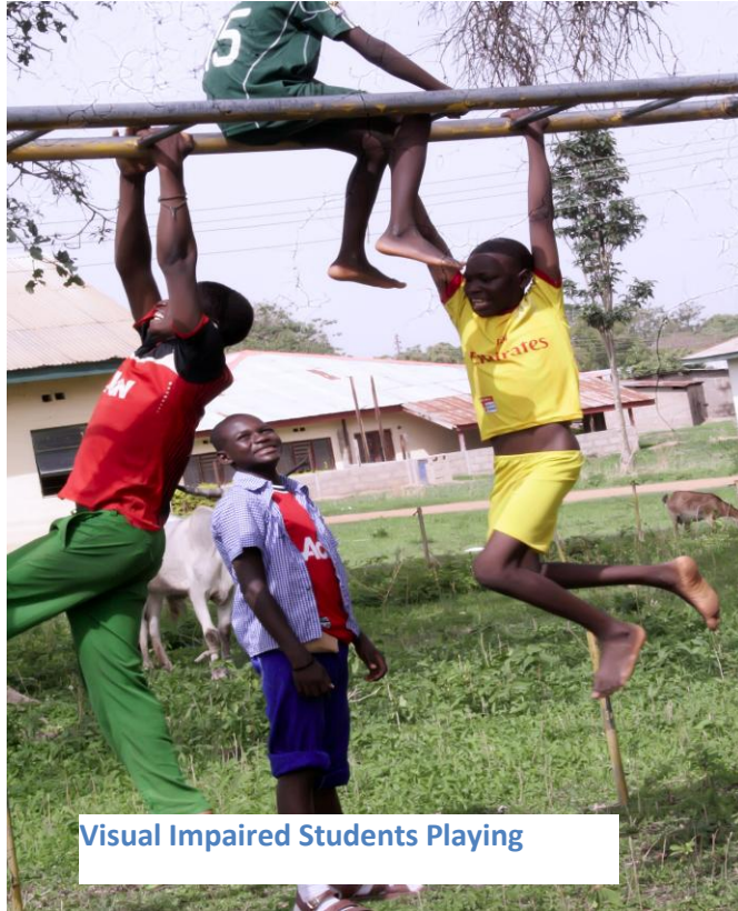
Visual Impaired Students Playing