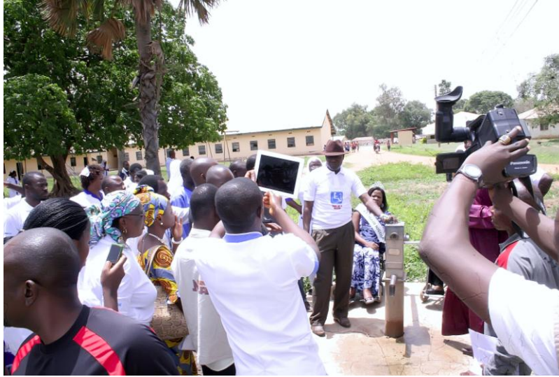
Commissioner of Water Resources Plateau State Hon. Idi Waziri inspecting one of the Water Facilities in the school

begin process upgrading existing toilets facilities to more accessible and modern for the students while better water sources will be provided in the school in addition to a provision of an overhead tank to serve as reservoir so as to ameliorate the challenges faced by the students especially during the dry season. A Technical committee was set up during the event by the commissioner comprising members of the Ministry of Water Resources, Plateau State Rural Water Supply Agency (PRUWASA) and State Water Board. The team is mandated to carry out further technical assessment of the WASH facilities in the school for immediate action. The Special Adviser Hon.Jams Lalu on his part also donated 20 set of mattresses to the school as a way of encouraging the educational development in the school and further pledged more support in the future from his office.