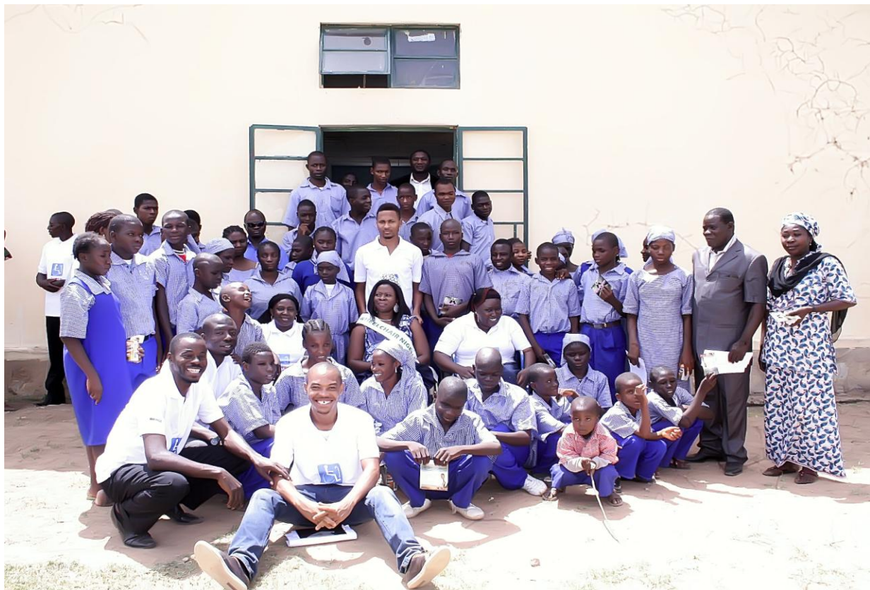
Group Photograph ,Ms Wheel Chair Queen with the Children at School during the visit

Great strides have been made by Development partners, Government agencies and other stakeholders in safeguarding the well-being of children in schools