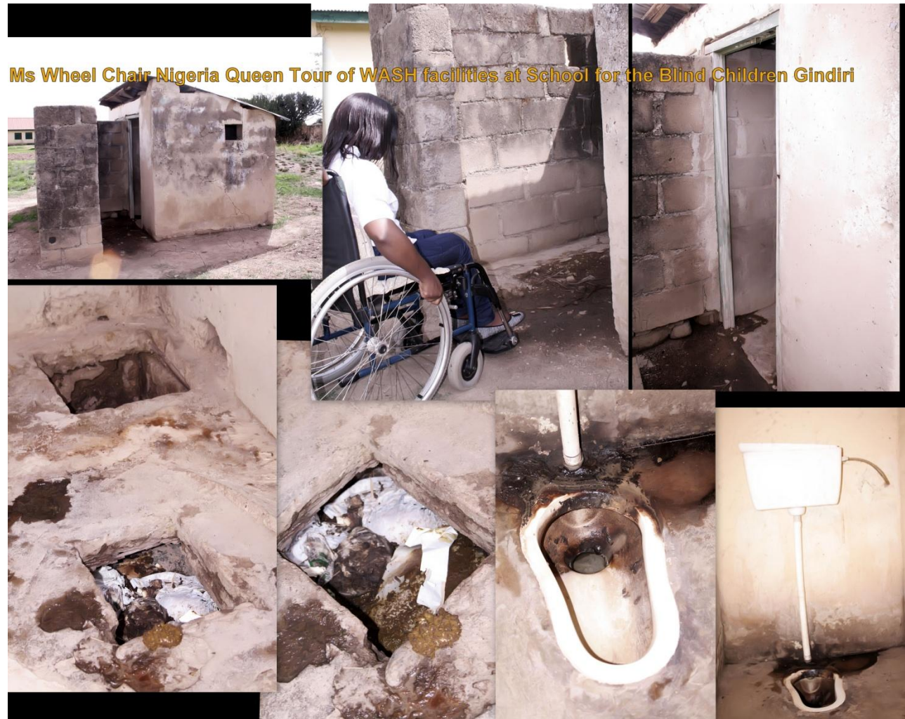
Ms Wheel Chair Nigeria Queen Tour of WASH facilities at School for the Blind Children Gindiri