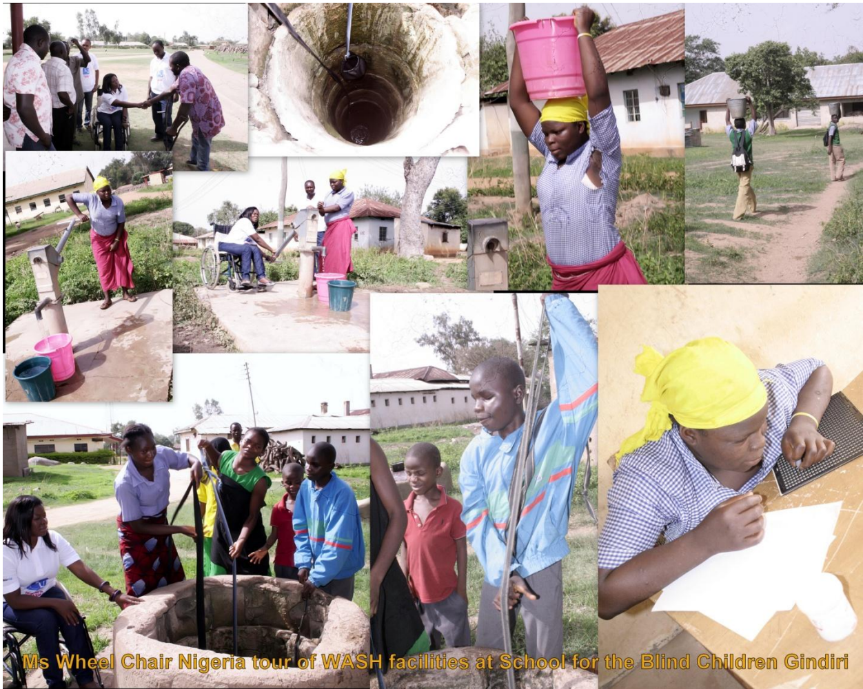
Ms Wheel Chair Nigeria tour of WASH facilities at School for the Blind Children Gindiri

Worried by the unpleasant hygiene condition in the school , the Ms Wheel Chair Team in partnership with WaterAid Nigeria commenced preparations for what will be the first ever forum to raise awareness on importance of WASH to Children with disabilities especially as it concerned their school enrolment, attendance and performance. It was the Ms Wheel Chair Nigeria outreach program to the school.