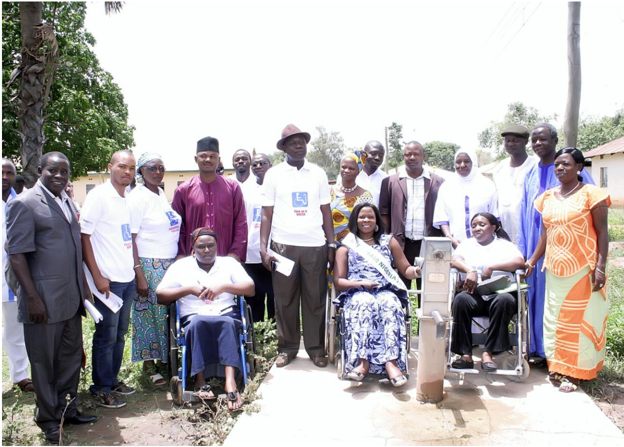
Group Photograph of Guests during the event