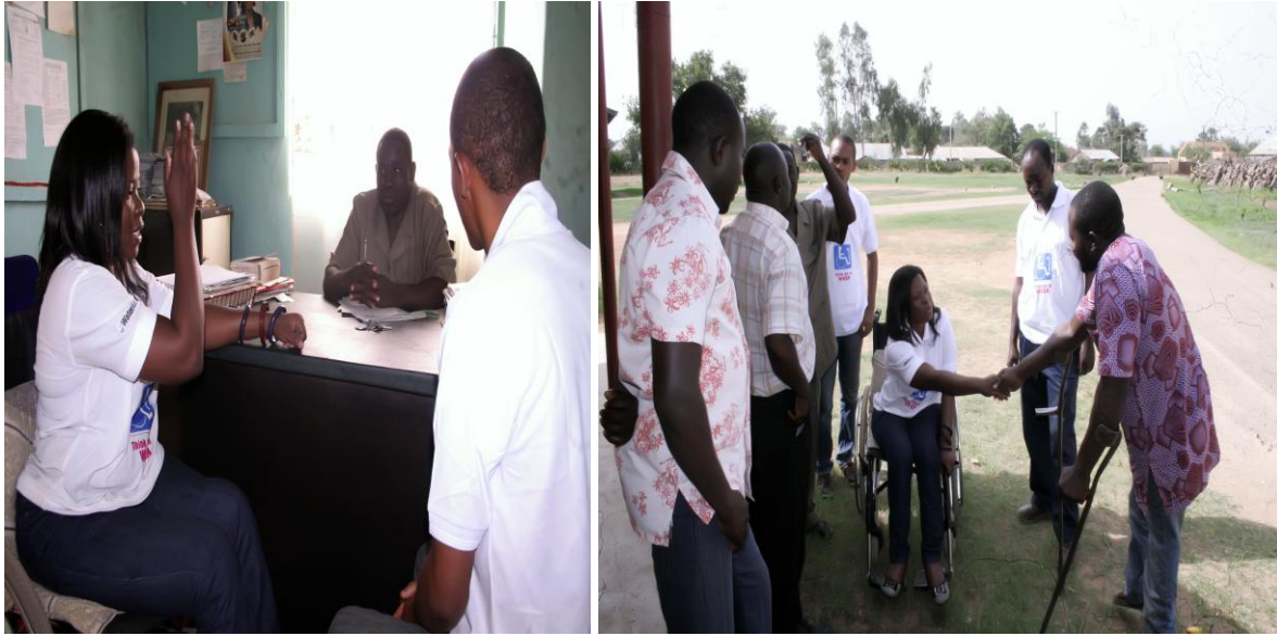
Ms WheelChair Queen interacting with School Management during visit

10. The students need WASH in program that is inclusive of their needs