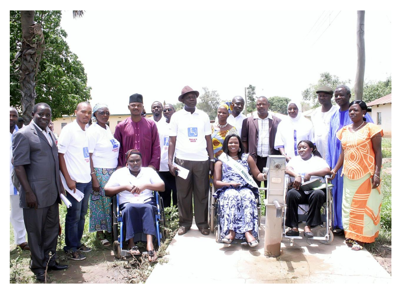
Group Photograph of Guests during the event