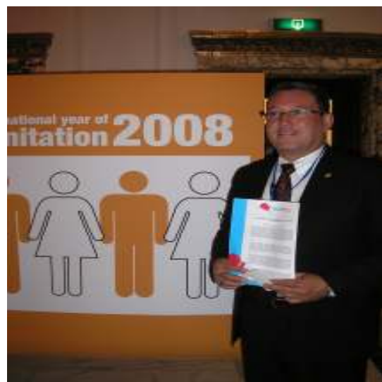
His Excellency Mr.Cesar Salgado, Minister for Social Investment Fund, Honduras, is seen holding GWA brochure