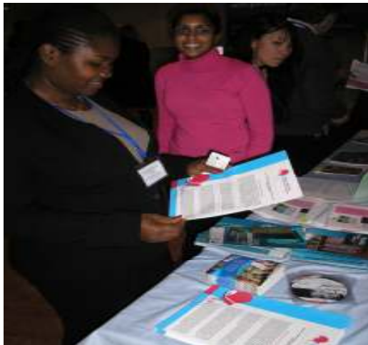
Symposium Participants in the GWA desk