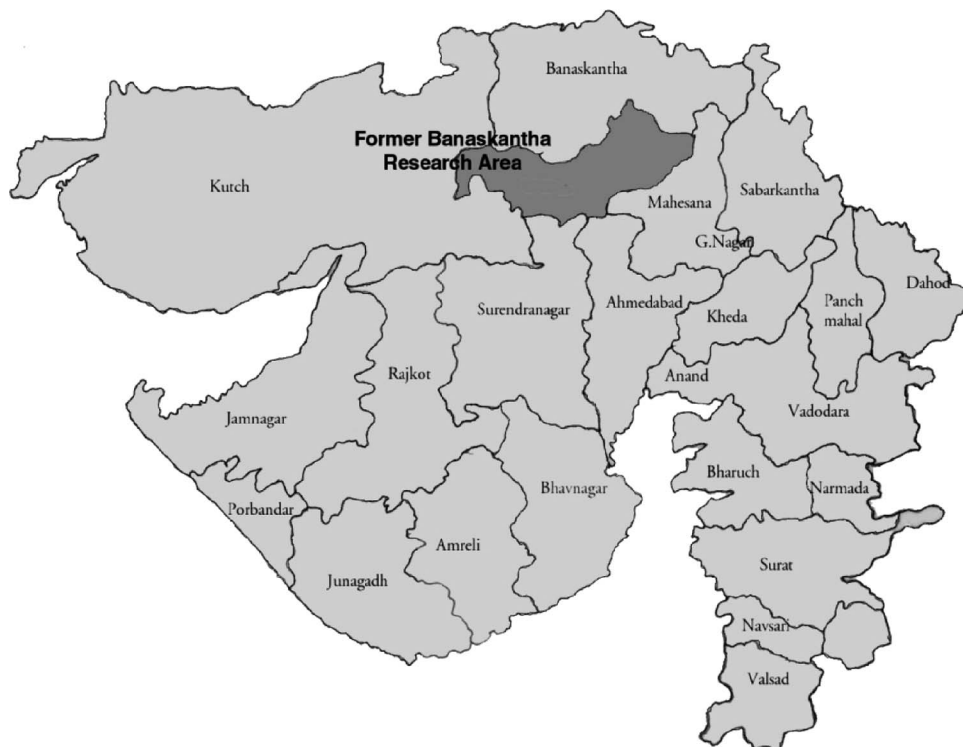
Fig. 1. Patan District in Gujarat.

SEWA's support covered the full market chain to help poor women establish and run their own enterprises. The women were assisted to organize around common interests, form democratically functioning groups, develop collective leadership and foster self-reliance through the emergence of new leaders from within the groups. Capacity building and leadership training were important elements.