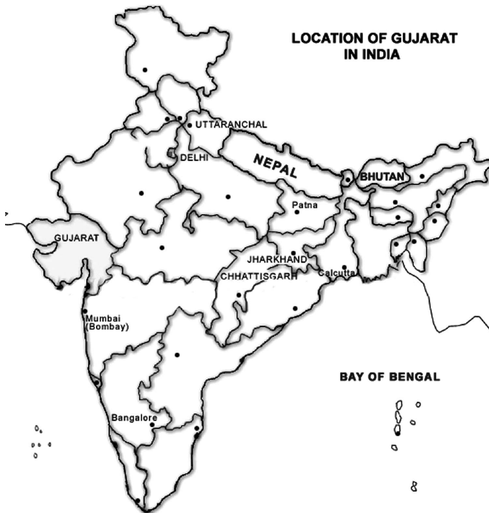
Fig. 2. Gujarat State, India.

The women were given access to technology, information, education and knowledge and received training in financial management and planning, product development, quality control and marketing. Groups were empowered to run their own enterprise so that they became owners and managers rather than just producers and labourers.