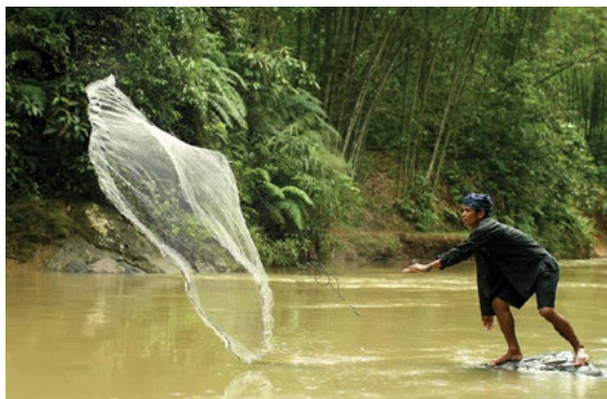
The livelihoods of poor men and women depend upon environments that are regenerative and support life.

Forests are lost to urban sprawl, and cut for firewood and housing materials and to make space for home gardens and crops. With watersheds no longer protected by forests, their capacity to supply and clean water is lost, further widening the urban water gap.