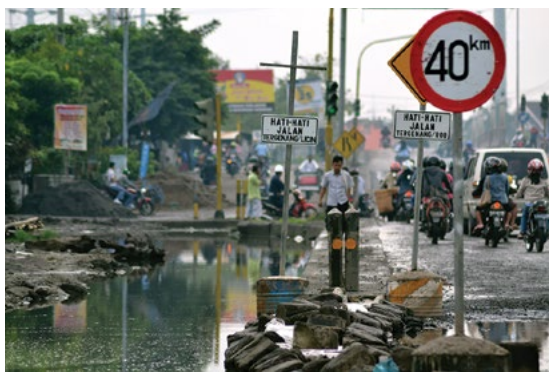
Urban dwellers living in poverty, in poor or informal settlements without basic infrastructure and services are often at the greatest risk from flooding.

actions taken by the poor to prepare for and protect themselves against climate change impacts. Women's roles are not adequately recognized in climate change adaptation efforts, either in national and global climate change negotiation talks, or in the context of climate change-influenced natural disasters.