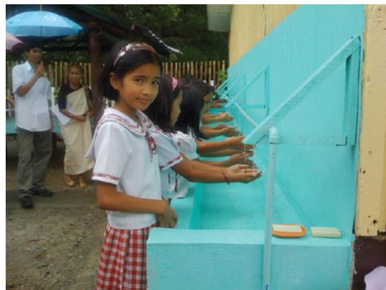
Hygiene education becomes more meaningful when sanitation facilities are in place.