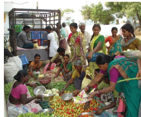
Financial incentive packages in line with IWRM principles can help protect livelihoods.

Using a gender approach, consider how priorities for water sector investment, post-economic crisis budgeting and financial