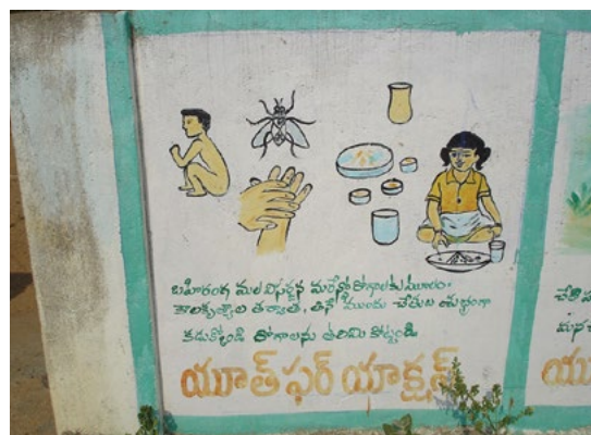
Access to safe, clean water, improved sanitation and good hygiene enables women and girls to take control of their lives.

When women do not have adequate access to sanitation, they may try to control their diets, leading to nutritional and health problems. Limited toilet opportunities for women increase the chance of urinary tract infections and chronic constipation as well as causing psychological stress. In many