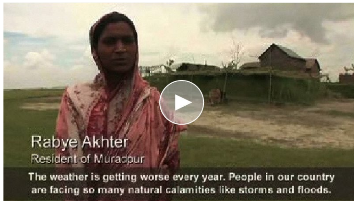
This short film illustrates how people in Bangladesh’s coastal zones are meeting the challenges of climate change. The views of poor affected women, local leaders and climate scientists are heard.

are often at the front line of adaptation to climate change at the local level, particularly as men increasingly migrate out of water-stressed areas in search of work.