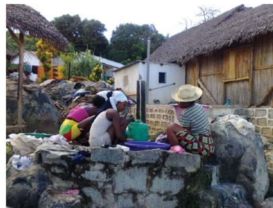
Gender sensitive budgeting in water sector programmes can create better access to water for local communities.