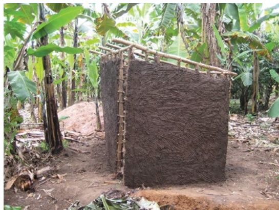
Sexual violence against women can be reduced drastically when gender sensitive decisions are made about location, privacy and other features of sanitation facilities.

better sanitation and addresses cultural barriers and taboos.