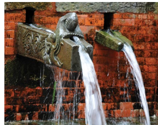
Cultural beliefs and values attached to water sources can help to protect them from contamination.