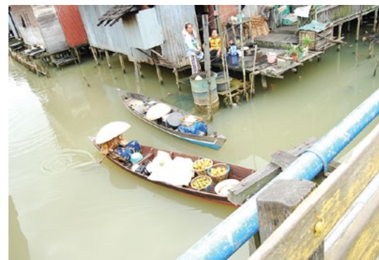
Greater protection for vulnerable people in the face of droughts or floods is important for protecting livelihoods.