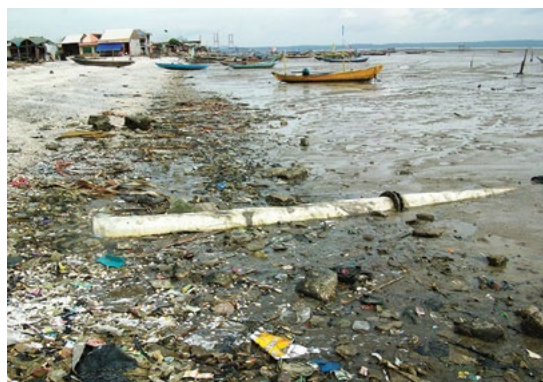
Many ecosystems are endangered by human activity, reducing the capacity of the environment to support life.

Poor rural families often depend directly on the environment, for food, water, shelter, farming and grazing livestock. More than 90 percent of the world's 1.1 billion poor rely on the environment for subsistence. Women and children often gather fruits and roots, while men hunt and fish.