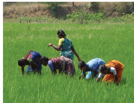
Although women and men perform complementary roles in agricultural systems, their tasks are often determined by their gendered roles.

Avoiding the excessive use of pesticides and fertilizers in favour of a shift to natural methods of pest-control requires cooperation and training of both women and men farmers.