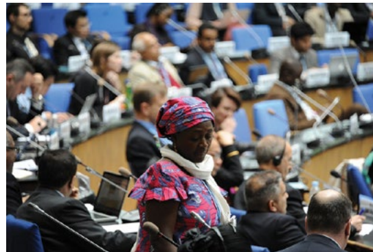
Women participating in UNFCCC-talks.

environmental sectors should mainstream gender.