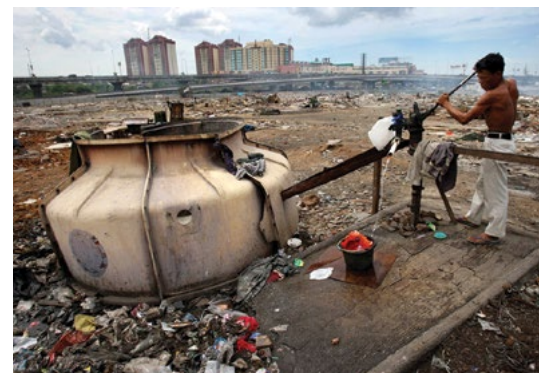
Innovative strategies need to be designed for special areas such as endangered coasts, mangrove ecosystems, and wetlands.