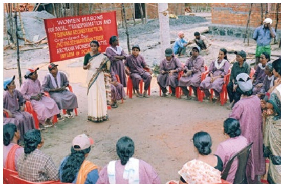
Technical and managerial staff, who are trained in gender and participatory approaches can help achieve more effective water and sanitation services.