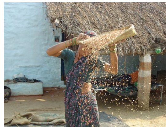
Crop insurance schemes for women farmers will help to protect and promote safeguards against the effects of financial crisis, climate change impacts and natural disasters on crop cultivation.