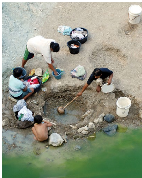
Women's knowledge of alternate ways to access water for domestic use should be taken into account when designing water projects and services.