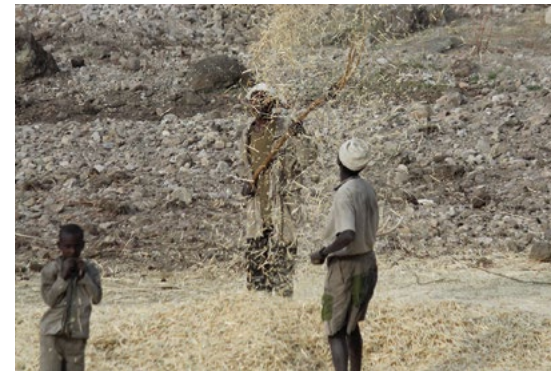
Farmers in Ethiopia, where agriculture is the foundation of the country's economy and makes up a significant portion of the country's GDP.