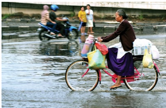
Flash floods, waterlogging, inundation and limitations on freshwater resources, due to extreme weather events affect the availability of water for domestic and productive tasks.

in turn leads to flash floods and waterlogging, and impacts freshwater resources, reducing the availability of water for domestic and productive tasks. Vulnerable groups – mostly women – are affected disproportionately, because of their limited access to, control and ownership of resources; unequal participation in decision and policy making processes; lower incomes and levels of formal education, and extraordinarily high workloads.