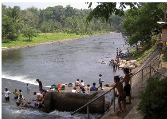
Mindanao river – used for washing, bathing and recreational activities.