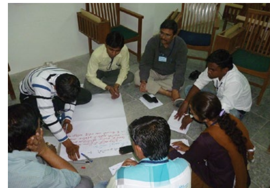
IWRM solutions can be found by using gender-sensitive participatory methods for project management and policy development.