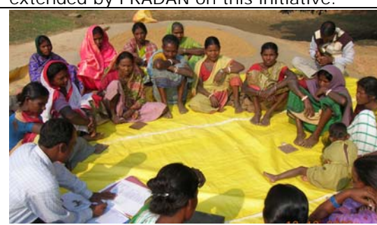
Group solidarity: paving way toward empowerment

Women of Amagara village, Purulia district in West Bengal has created a noteworthy instance in watershed management, securing livelihood through self-help group formation, obtaining technical skill extended by PRADAN on this initiative.