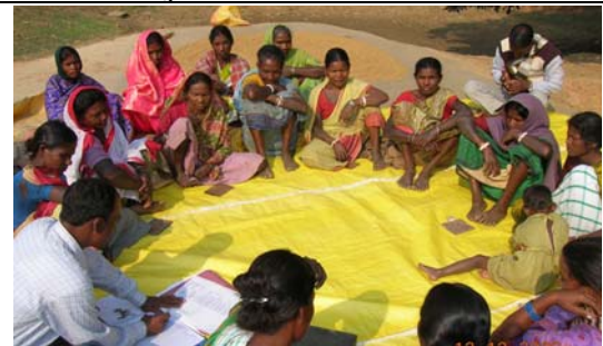
Group solidarity: paving way toward empowerment

Women of Amagara village, Purulia district in West Bengal has created a noteworthy instance in watershed management, securing livelihood through self-help group formation, obtaining technical skill extended by PRADAN on this initiative.