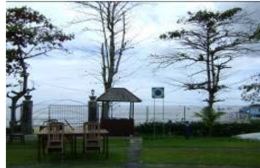
Picture: A view the coast in Balikpapan

experience of her enchanting journey from Tokyo to Balikpapan through her portrayal of the beauty of nature and lives.