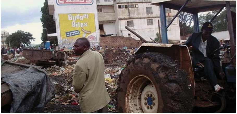
<sup>1</sup> UN-HABITAT (2003), Water and Sanitation in the World's Cities: Local Action for Global Goals, Earthscan, London.

There are two other categories of urban centres where provision for water and sanitation is usually very inadequate. The first is the thousands of urban centres that have more than 20,000 inhabitants but that do not have the size and the political visibility to get much attention from national policy makers. Initiatives to improve 'urban' provision for water and sanitation also tend to forget these. For more urbanized nations, 20-40 percent of their total population is in urban centres with less than 200,000 inhabitants; for less urbanized nations, urban centres with less than 200,000