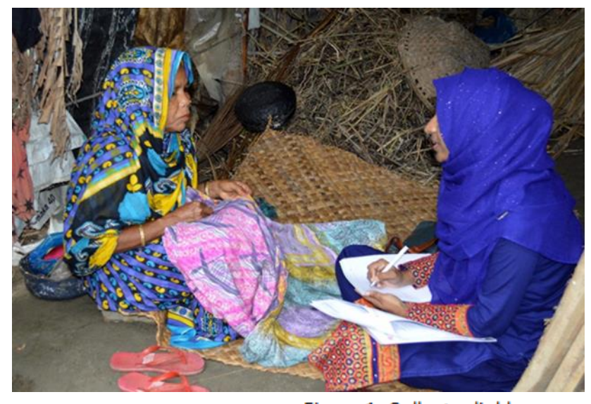
Figure 1: Collect reliable information

Media Work: Media work involves raising public awareness for your issue, providing information messages with a view to change opinions, attitudes and behaviour. It implies creating advertising campaigns, publishing leaflets in magazines, or directly sending them out through a mailing list, or painting on the wall (only where that is not illegal), putting posters in places where they will reach the targeted audience. The media