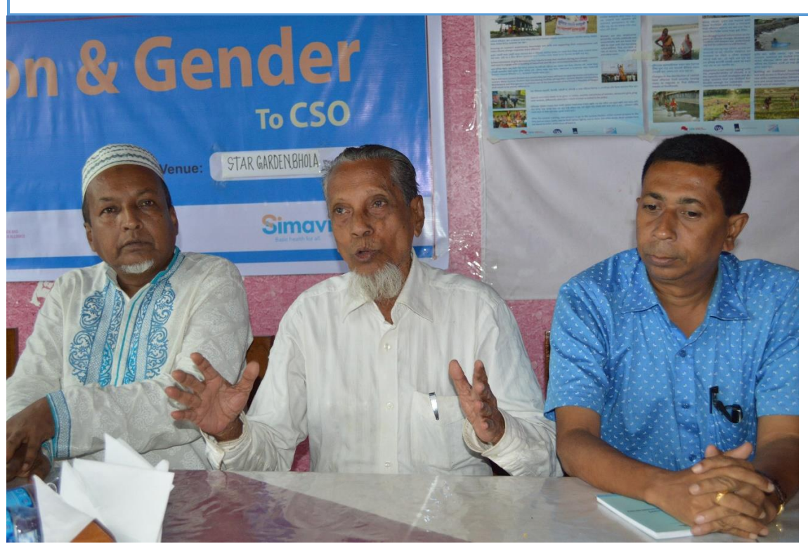
Gender, Inclusion, IWRM and WAH advocacy coaching

After the plenary, the facilitator should try to summarize the main ideas and conclusion of the discussions