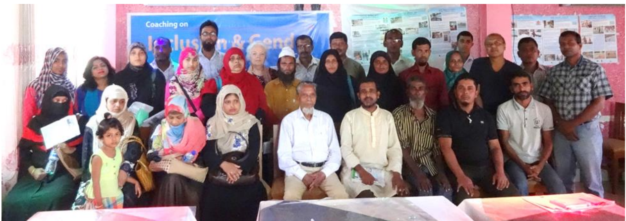
Figure 3. The local CSOs of Bhola, organised for shared inclusive advocacy, together for Inclusion and Gender Training