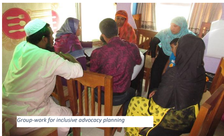
Group-work for inclusive advocacy planning