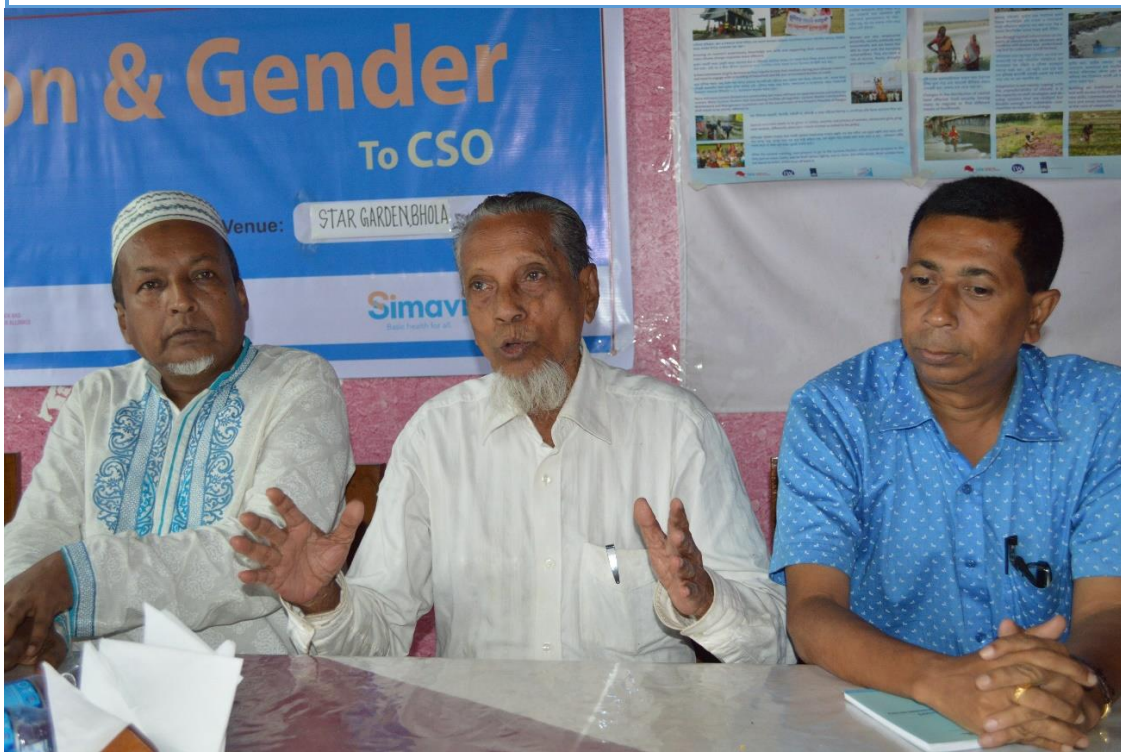
Gender, Inclusion, IWRM and WAH advocacy coaching

After the plenary, the facilitator should try to summarize the main ideas and conclusion of the discussions