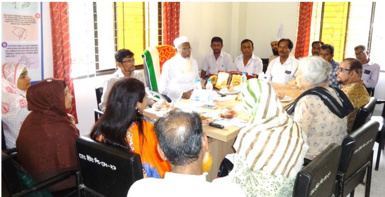
Advocacy: Discussing gender and inclusion in WASH with Union Parishad

After plenary, the facilitator should try to summarize the main ideas and conclusion of the discussions