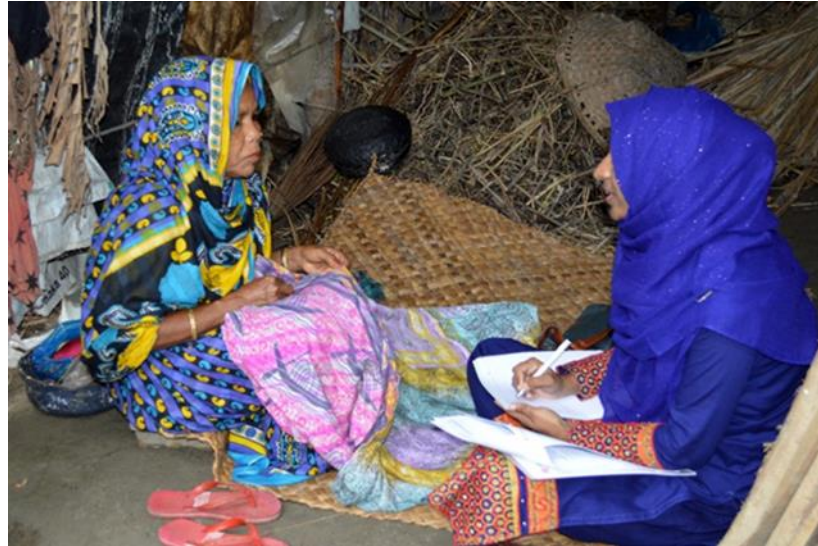
Figure 1: Collect reliable information

Media Work: Media work involves raising public awareness for your issue, providing information and messages with a view to change opinions, attitudes and behaviour. It implies creating advertising campaigns, publishing leaflets in magazines, or directly sending them out through a mailing list, or painting on the wall (only where that is not illegal), putting posters in places where they will reach the targeted audience. The media can play a significant part in public advocacy work.