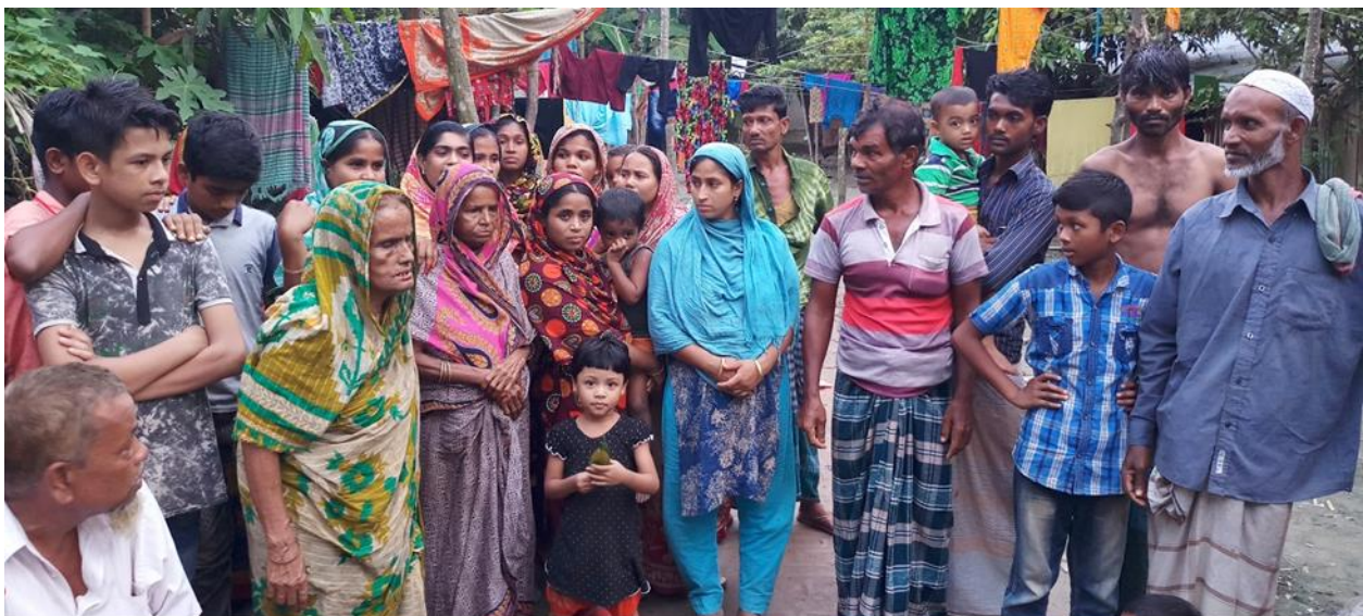
All groups of people living in the cluster village of Bhola (Bangladesh) are talking about the vulnerable situation of their WASH facilities

A practical way to frame your plan is developing a logical framework including objective, targets, activities for the advocacy, that includes indicators to monitor and measure progress and means of implementation (who is responsible and what resources are available for activities). The participation of the targeted groups, key actors (as local leaders, women’s organization, youth organizations, etc.) is essential while developing the logical framework for the advocacy planning. Table 1 below shows what the logical framework could look like when you, for instance, advocate for improving WASH facilities for the people who are living in cluster villages 5 of Bhola in Bangladesh with miserable toilets and water available far away. You should ensure that your action plan is flexible enough to make changes when it is required. Periodic review of your plan and reflexive learning (see module 3 of GWA Training Manual) will help you to stop and assess whether you need to adjust your plan accordingly. The periodical assessment should be made with the active participation of the most relevant stakeholders.