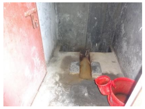
Details of girls' toilets

In the girls' WASH block, of the three toilets, one is always locked. The two open toilets have lots of problems such as- lower part of the doors are broken, not clean at all, no MHM facilities, bad smell, not functioning water basin, etc. And the other two toilets are like from primitive period without any commode and direct water supply system as well as very dirty.