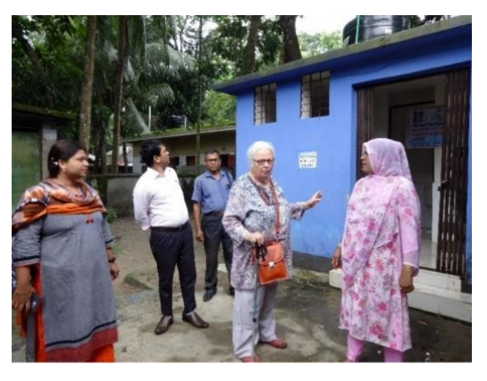
The toilet block for boys of the Ukilpara Primary School, built in 2017 by DPHE

After crossing one of the two beautiful new bridges, which connect the school compound with the main road, we reach the Ukilpara Government Primary School, where 150 children, 80 boys and 70 girls study up to class 5. A bit further is the Ukilpara Secondary Girls' High School, which is recognised by the government, but is governed by a Board, for girls from class six to ten. The objective to visit the Ukilpara schools was to observe the WASH facilities in the school for the students. This school was selected by Mr Akmal Hosen, Executive Engineer, DPHE-Bhola. The GWA-B team along with the DPHE officers, the DORP team