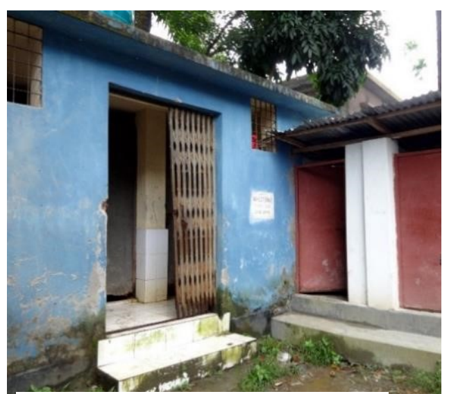
Toilet block for girls of the Ukilpara Primary School, also used by 500 girls of the Ukilpara Girls High School, constructed in 2014 by DPHE

In the school, DPHE constructed two WASH blocks for girls and boys of the primary school in separate places. One building with three toilets and two urinals for primary school boys has been