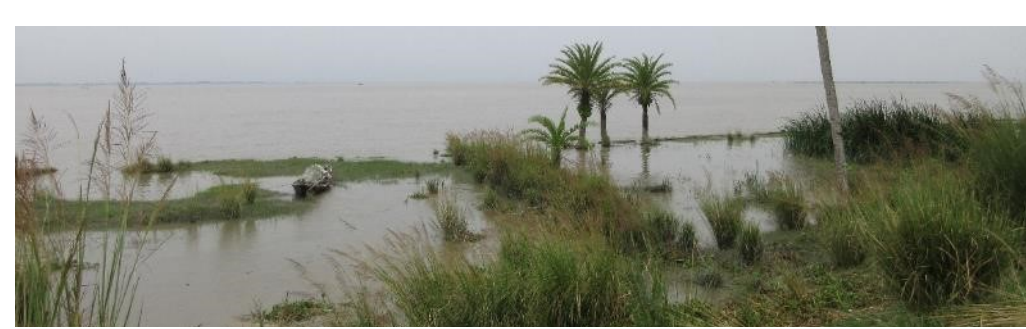
The BWDB sand bags are just visible above the water level at high tide

Besides, whilst walking for some miles over the embankment, the GWA-B team talked with the