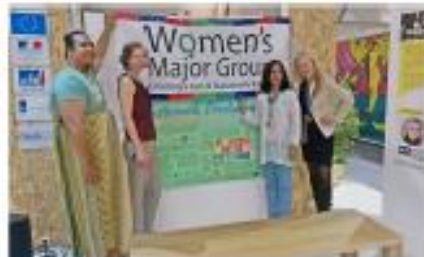
GWA-B team leader in COP-22, Marrakech as part of Women's Major Group